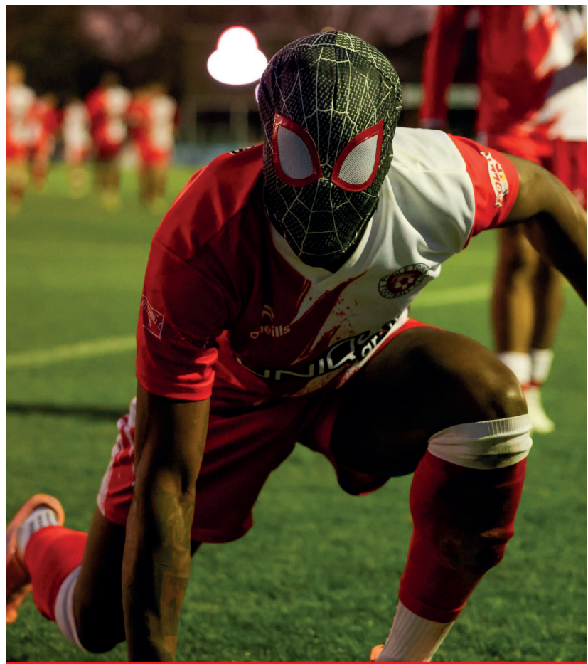
Second-place Poole Town will be looking to use their super powers again this weekend

Please check before travelling to any of these games as the winter weather is sure to play its part again this weekend.