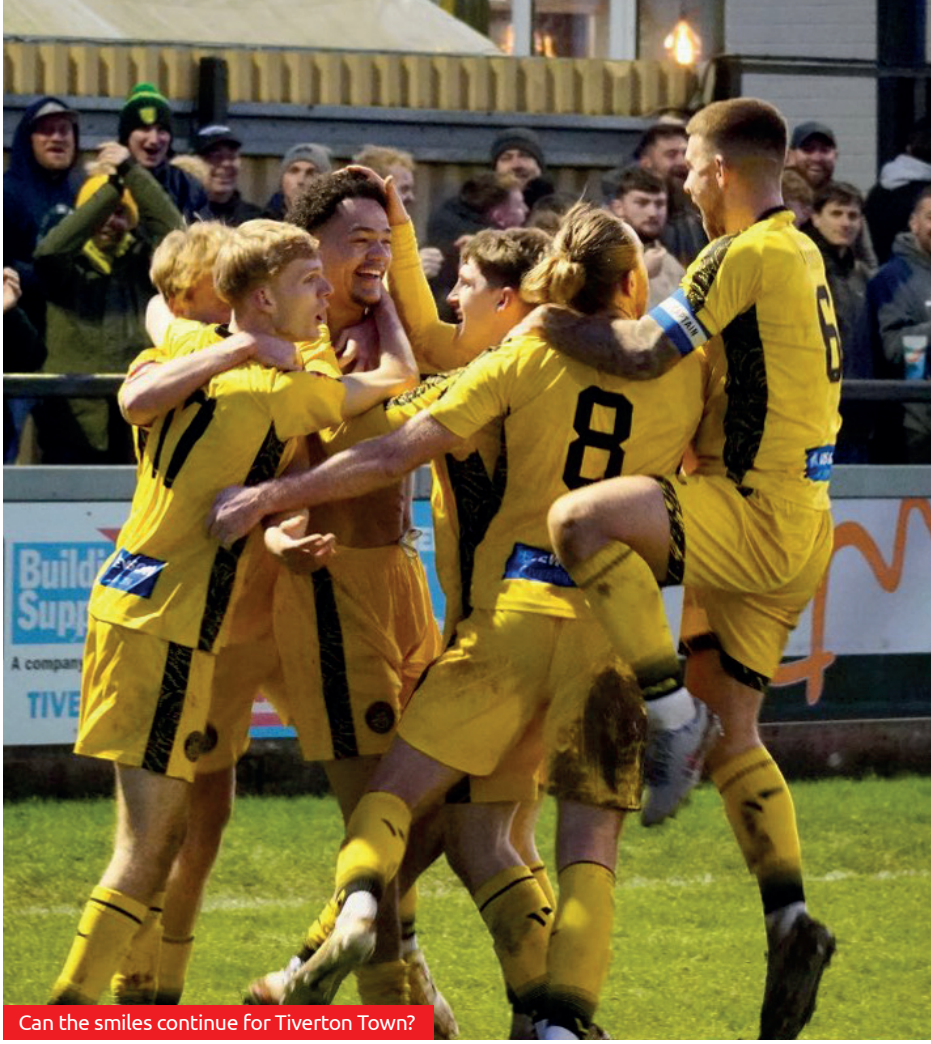
Can the smiles continue for Tiverton Town?

"It was the performance from the whole team that was the most important thing for me," he told us. "As a group, we stuck together; even when Taunton went level, we didn't drop our heads and kept going, which led us to the second goal and three more points. "I'm buzzing to get a goal and play my part in the win. Hopefully more goals will follow for me now. "To make it two wins in a row was fantastic and has done our confidence the power of good. We're looking to continue pushing forward as a team now and continue to add to our points tally. "These last two games have given us plenty of belief so we'll see where this can take us.