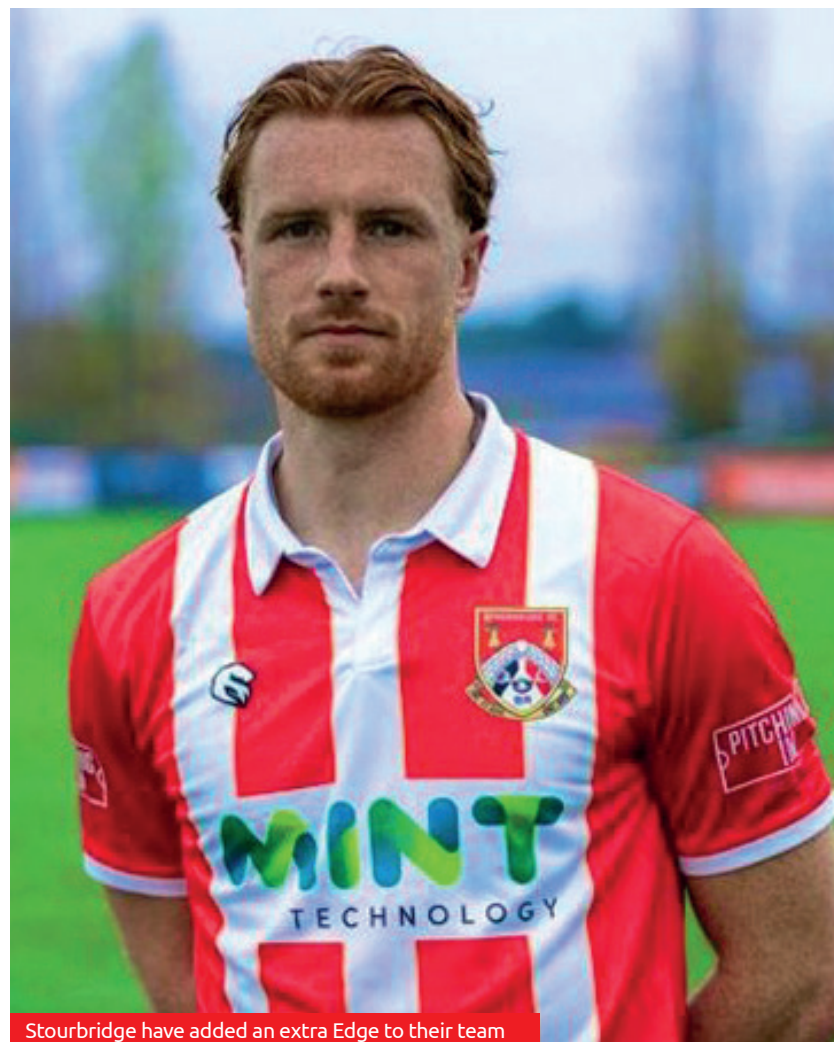
Stourbridge have added an extra Edge to their team