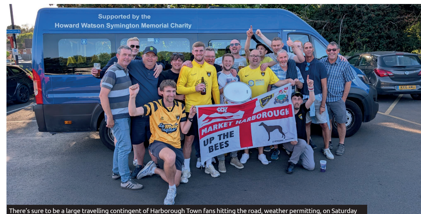
There's sure to be a large travelling contingent of Harborough Town fans hitting the road, weather permitting, on Saturday

As always, please check before setting out to games to avoid wasted journeys in difficult conditions.