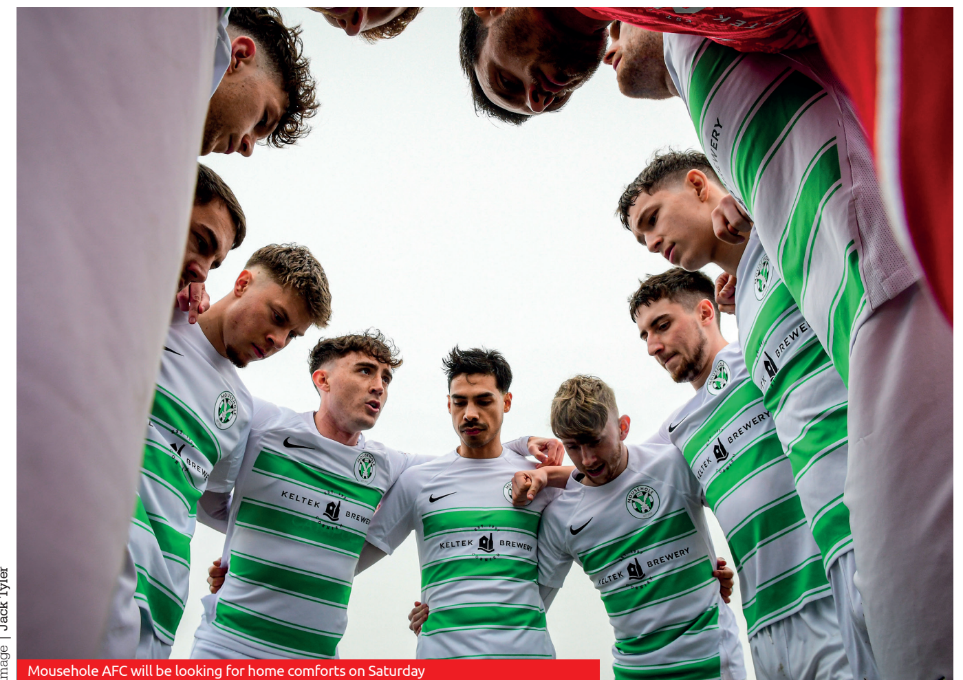
Mousehole AFC will be looking for home comforts on Saturday

There's a tasty top against third clash taking place, weather permitting, at Winchester City as they host leaders, Frome Town. Sandwiched in between them are Portishead Town who to a Willand Rovers outfit who are desperate for the points for different reasons.